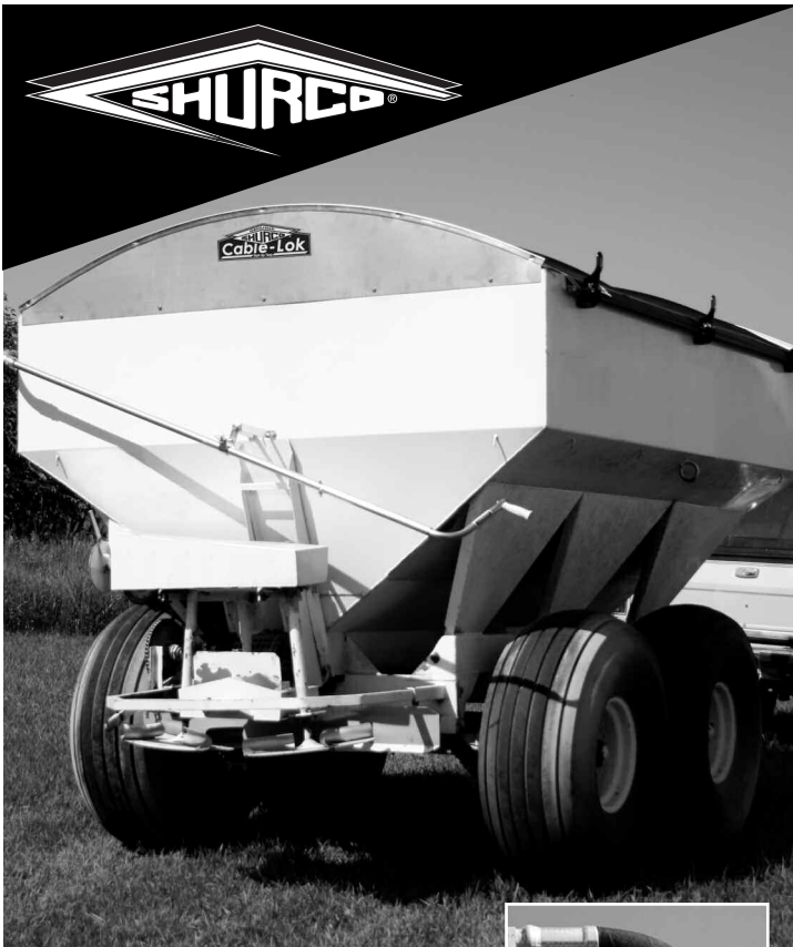
The Cable-Lok's new stainless steel arm (shown below) is a more economical selection than the previous arm (above).

For additional information about Shur-Co® products, give us a call at 1.800.474.8756 Monday through Friday, from 8:00 a.m. to 5:00 p.m. Central Time. Our friendly and knowledgeable Customer Service Representatives will be happy to answer your questions. Or log on to our website at www.shurco.com .