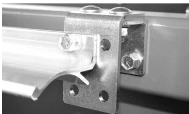
Here the adjustable bracket is shown positioned with the long side against the box, indicating that the gate hinge (see inset above) on this box measures 2" to 2-1/2" wide.