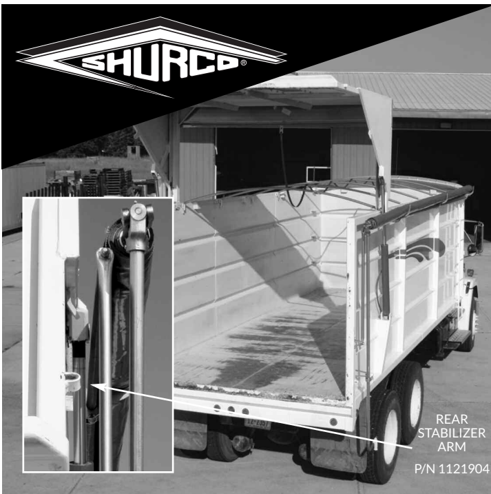
Above: Farm bodies with a high-lift end gate wider than the box (see inset) can be equipped with our Adjustable Offset Bracket kit to flush out the tarp stops and latchplate and our Rear Stabilizer Arm to support the fixed tube.

For additional information about Shur-Co® products, give us a call at 1.800.474.8756 Monday through Friday, from 8:00 a.m. to 5:00 p.m. Central Time. Our friendly and knowledgeable Customer Service Representatives will be happy to answer your questions. Or log on to our website at www.shurco.com .