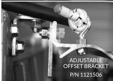
Side view of same alignment. The adjustable bracket creates space between box, tarp stops and latchplate. Use it wherever a hinge gate interferes with the standard install procedures.